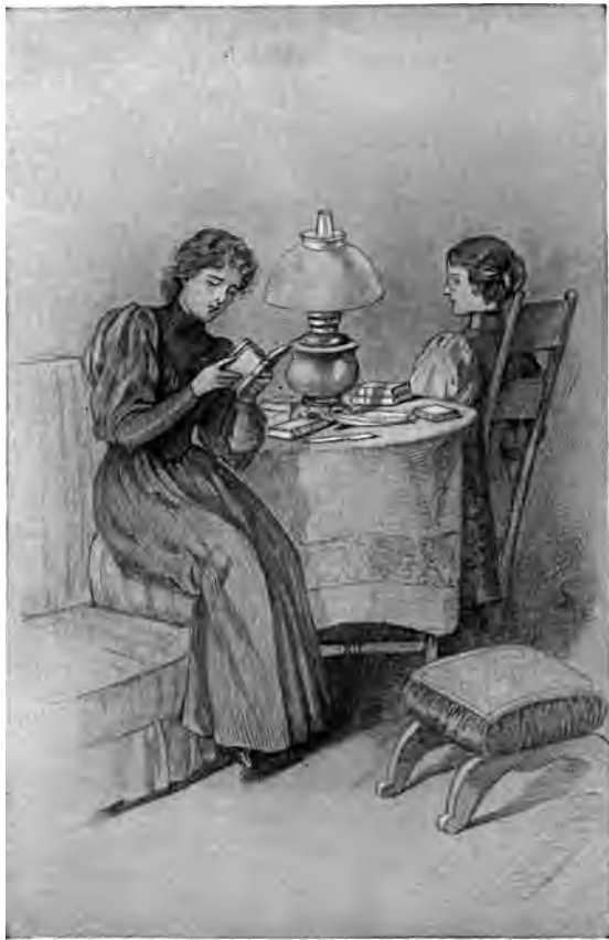
"SHE OPENED THE BOOK AND READ"